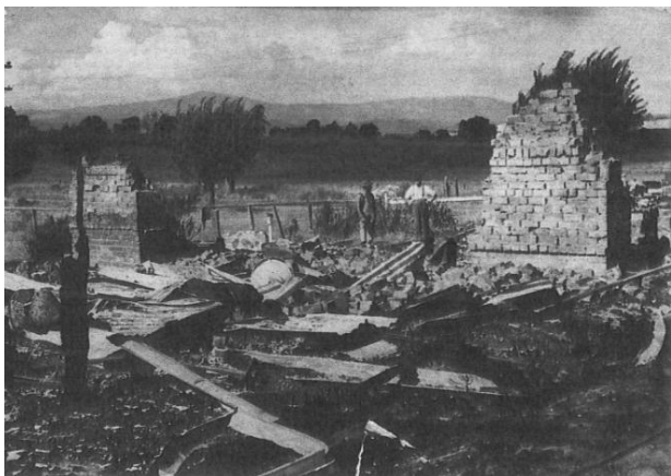
Donated to the society by his family.

Thursday February 15 1951 was a black day in the history of the community, particularly for members of the RSSAILA 7 , because fire destroyed the Memorial Hall.