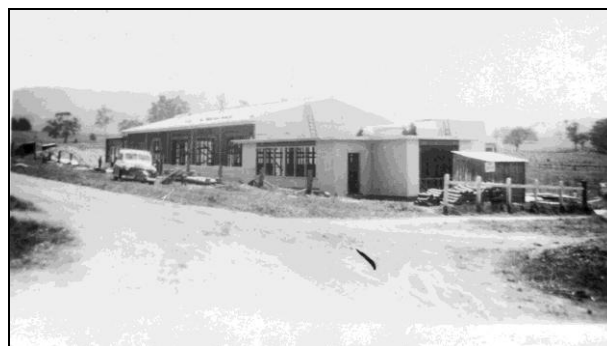
The new Hall nearing completion

a timber building clad externally with flat asbestos cement sheet, vertical pine lining boards and weatherboards covered with imitation brick siding. The main hall auditorium roof is covered with asbestos cement super six corrugated sheets. The ridge, associated capping and flashing is moulded asbestos cement. .... The floor is timber throughout. The main hall is supported structurally by open web type steel portal frames with independent footings. 8